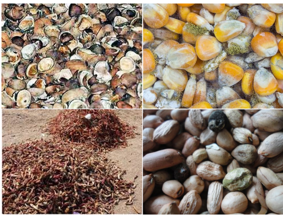
Figure 2: Occurrence of aflatoxins in food crops

can also be contaminated and afflicted with AFs due to improper storage and processing conditions. Furthermore, the presence of AFs in eggs collected from a poultry farm and in raw cow milk in Cameroon was reported by Tchana et al. (2010). Due to this, the affected crops contribute to the entry of AFs into the food chain, which is strongly dependent on climatic conditions. The occurrence of aflatoxin in food products varies geographically and the toxicity in particular food products depends on the frequency of consumption by different ethnic groups and nations.